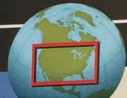
Largest Ancestry Reported by County 2000

One of the defining attributes of the United States is that it is largely a country of immigrants and their descendants. About 13 percent of people in the United States are foreign born, while Native Americans, Alaska Natives, and Native Hawaiians make up about 2 percent of the population. The remaining population is descended from immigrants. 1A, 6B, 7B, 16A, 17D